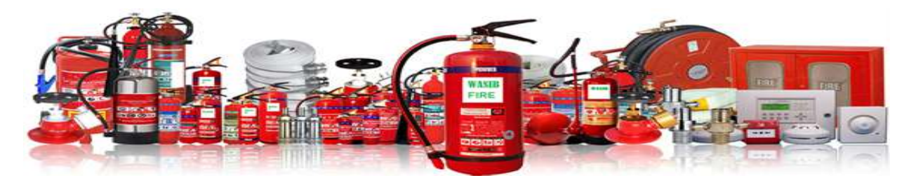
Extinguishers Co2, Powder, Foam, Water